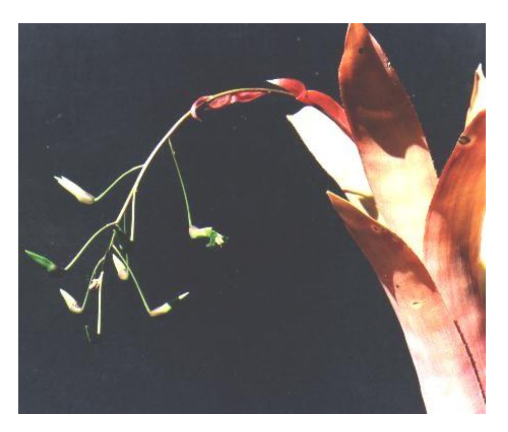
B. viridiflora.

B viridiflora is rather different than most Billbergia in various respects. First, its flowers are on long pedicels, up to 5 cm. Second, while most Billbergia are found in Brazil, this one is found in southern Mexico, Belize and Guatemala.