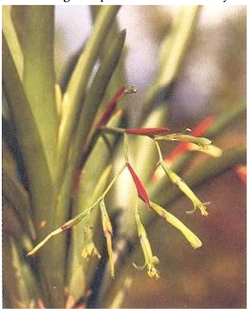
B laxiflora , photo by Baensch.

From the perspective of the key, B laxiflora falls within the same group as B chlorantha . But it differs considerably. It is described as having green linear petals, red margined sepals and a densely lepidote ovary. Unlike most Billbergia , its peduncle bracts are fairly unimpressive.