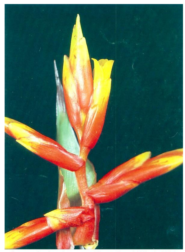
Guzmania victoriae see J Brom Soc 41(1): 1. 1991