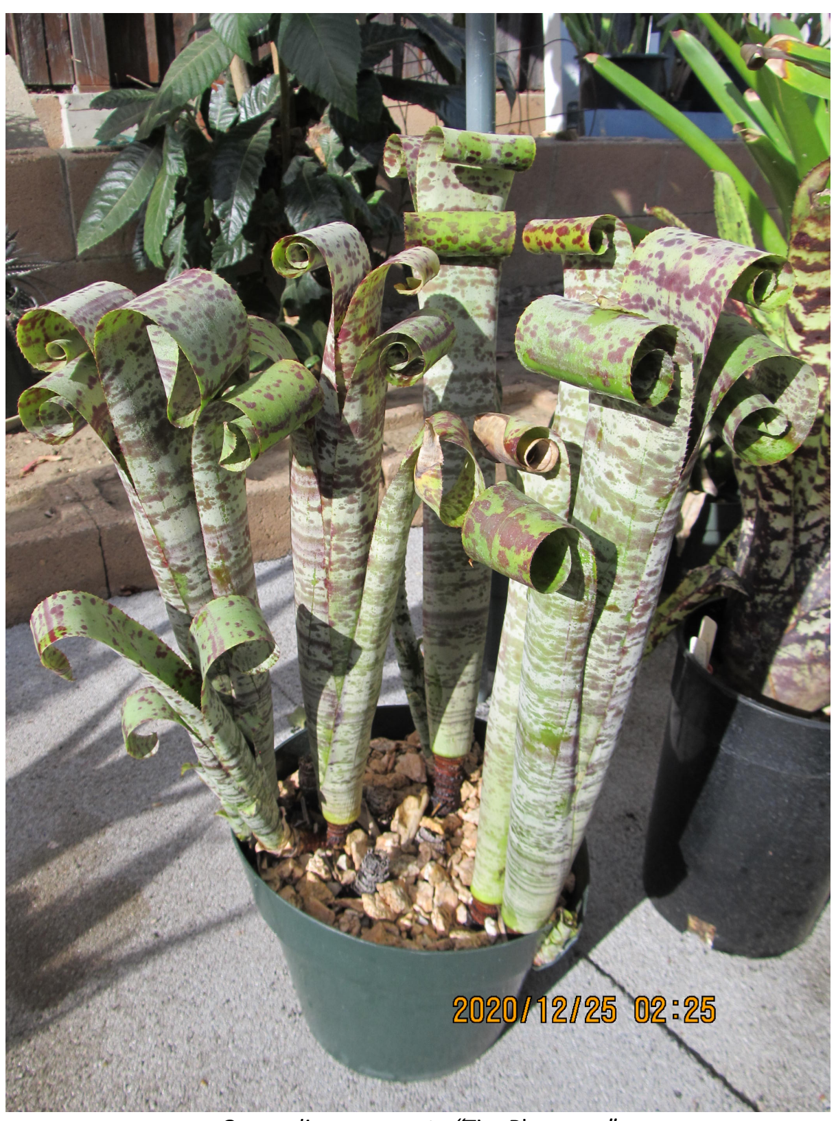
Quesnelia marmorata "Tim Plowman" Photo and plant courtesy of Bryan Chan