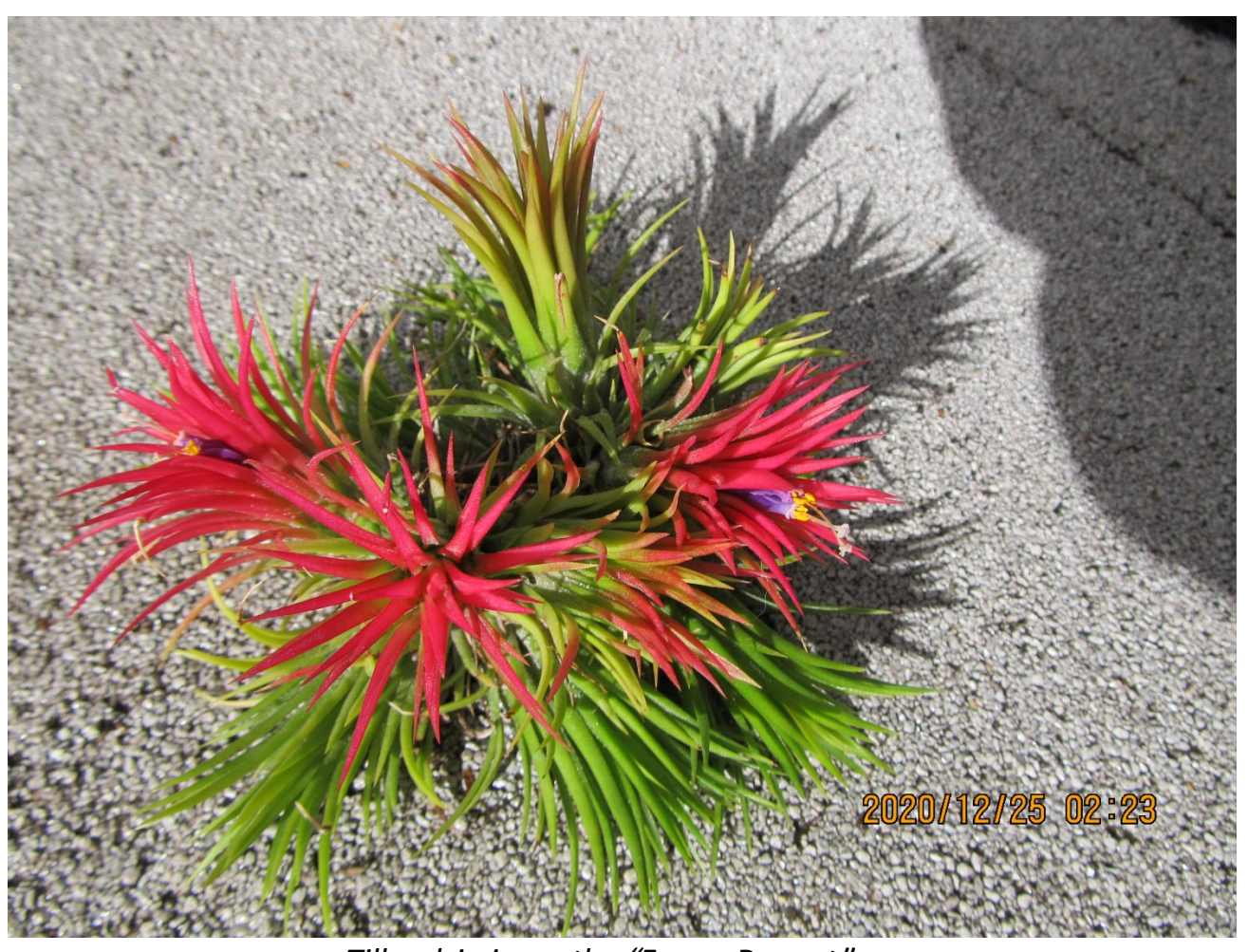
Tillandsia ionantha "Fuego Peanut" Photo and plant courtesy of Bryan Chan