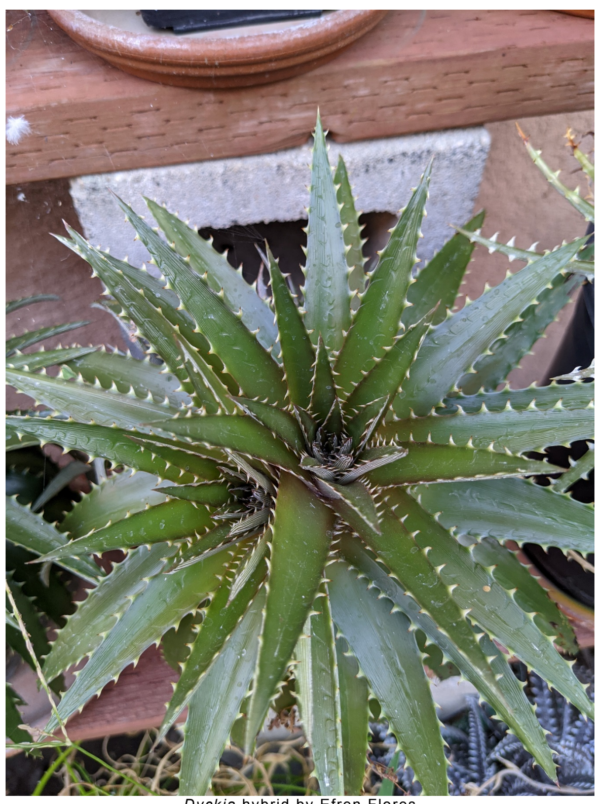
Dyckia hybrid by Efren Flores